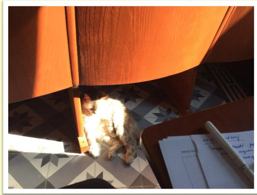
Day 2: Cats literally occupied room TB310

landscape parks with similarly utopian media images that are in fact severely exploited under the guise of “organic agriculture” driven by a powerful “bio” lobby.