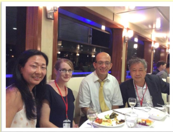
Day 4: Dinner cruise on the Bosphorus was an exquisite social event