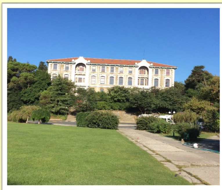
The Faculty of Arts and Sciences where the Conference was Held

First of all, I wish to acknowledge the fund from the Toshiba Foundation for providing the great opportunity that allowed me to attend the 26th conference of JAWS, which was held at Boğaziçi Üniversitesi in Istanbul 1st – 4th of September 2015. I joined JAWS a few months before and the 26th conference was the first JAWS event that I have attended. More than ninety researchers from all over the world were involved in this meeting and presented topics that were mostly based on extensive research conducted in Japan. The presented papers covered research topics from anthropological approaches to various aspects of life and contemporary issues in Japan to paradigm changes in Japanese anthropology. Some of them inspired me to reconsider my research from different angles as well as opened new possibilities for my future research interests. On the first day, tutoring sessions for graduate students were organized and the welcoming reception for all participants was held. I did not have a tutoring session because I am an