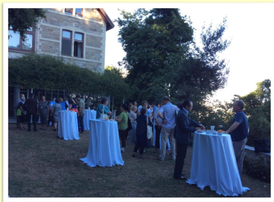
Day 1: Reception for the conference participants: Networking in progress

intellectual historian rather than anthropologist and therefore my research did not match the tutor's. Nevertheless I had many chances to discuss my academic interests with other research fellows during the conference. I also appreciated the very congenial atmosphere of the pre-conference reception for all participants and conveners held at nightfall next to the Bosphorus. Social networking with others encouraged me to share my ideas on research topics and exchange information with more experienced colleagues who are based in Japan.